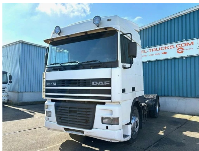
DAF 95.380 XF SPACECAB (EURO 2 / ZF16 MANUAL ... 4x2