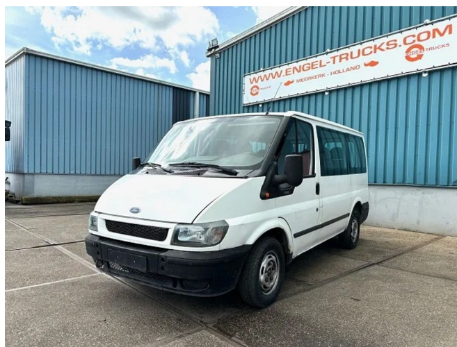
Ford TRANSIT T300 TOURNEO 2.0D 9-PERSON MINI... 4x2