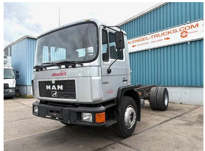
MAN 18 18.232 4x2 FULL STEEL CHASSIS (MANUAL GEA...