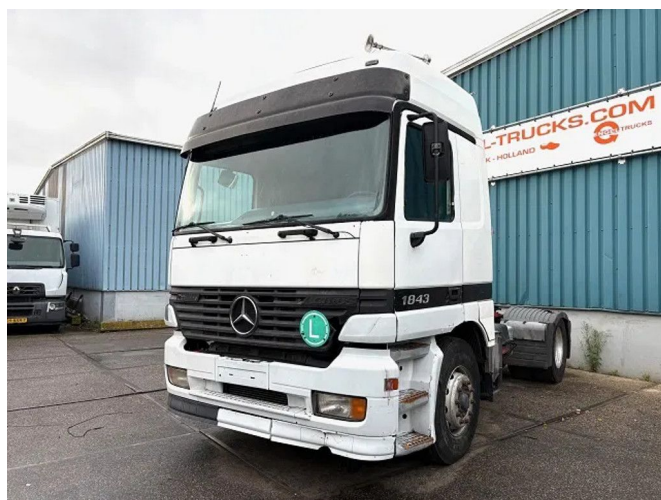
Mercedes-Benz Actros 1843 LS (MP1) (EPS WITH CLU... 4x2