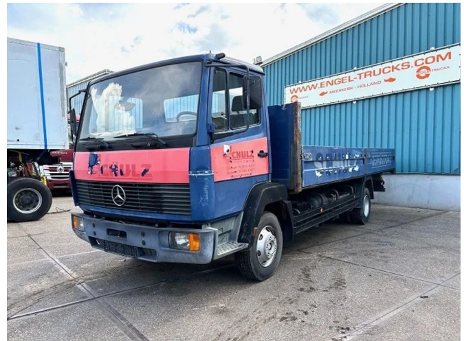
Mercedes-Benz LK 814 (6-CILINDER) FULL STEEL SU... 4x2 Referenznummer: SN 56411062