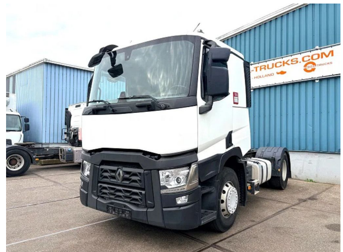
Renault T460 PROTECT SLEEPERCAB (EURO 6 / I-SH... 4x2