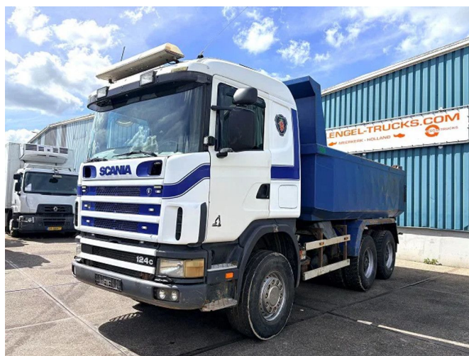
Scania R124-470 C 6x4 FULL STEEL KIPPER (MANUAL G...