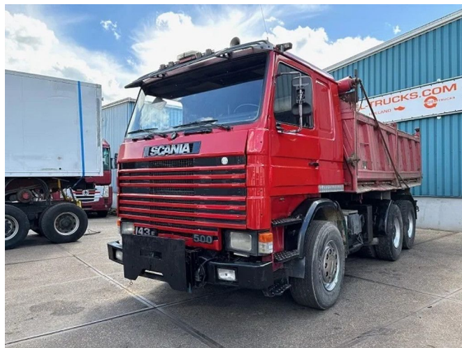
Scania R143-420 V8 6x4 FULL STEEL MEILLER KIPPER (M...