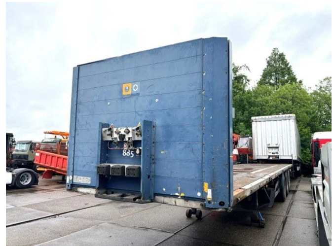
Schmitz Cargobull SCS 24/L 3-AXLE FLATBED TRAILER (D... Referenznummer: SN 60355362