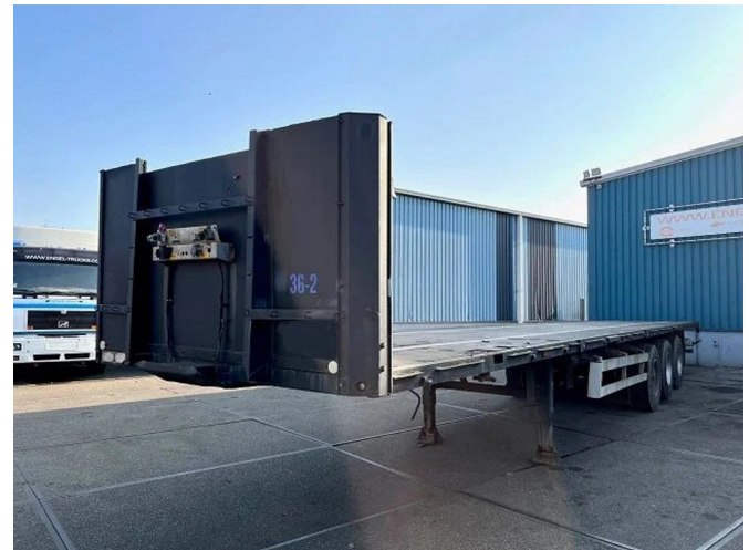
Van Hool 3B1047 13.60M. FLATBED TRAILER WITH 40FT ... Referenznummer: SN 51938877