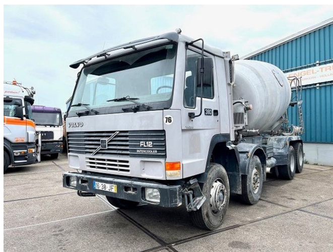
Volvo FL 12 -380 8x4 FULL STEEL CIFA 11M3 CONCRETE M...