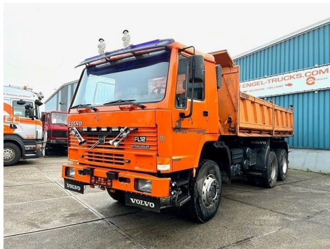
Volvo FL 12.380 6x6 FULL STEEL SUSPENSION MEILLER K...