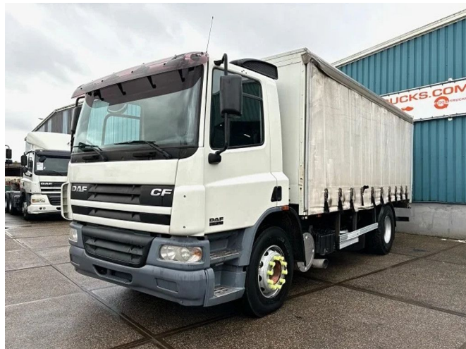
DAF 75 .310 4x2 WITH CURTAINSIDE BOX (EURO 3 / MAN...

• ABS • Boîte à outils • Climatisation • Différentiel d'écartement • Limiteur de vitesse • Pare-soleil • Radio / lecteur CD • Régulateur de vitesse • Système anti-blocage