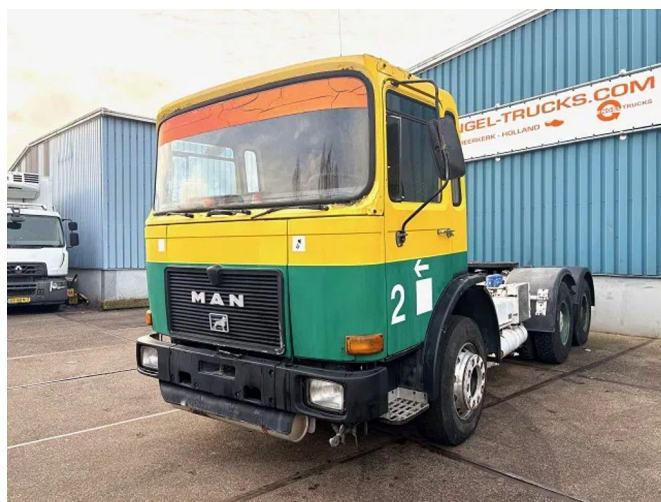
MAN 26 240DFS FULL STEEL SUSPENSION / DAYCA... 6x4