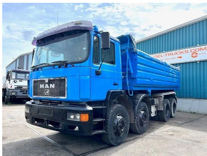
MAN 41.464 F2000 8X4 FULL STEEL KIPPER (EURO 2 / ZF... Referentienummer: SN 55149234 Z

• ABS • Différentiel d'écartement • LAMES • Limiteur de vitesse • Pare-soleil • Prise de force • Prise de force (PTO) • Radio / lecteur CD • Système anti-blocage