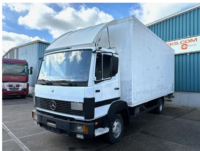
Mercedes-Benz LK 814 6-CILINDER WITH PLYWOOD ... 4x2