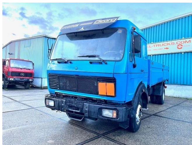
Mercedes-Benz SK 1635K GROSSRAUM 4x2 FULL STEEL ... Referentienummer: SN 53970515 Z