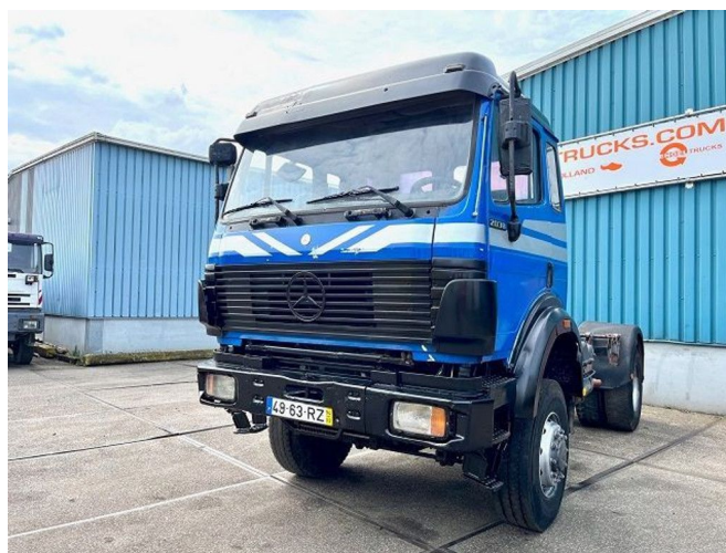
Mercedes-Benz SK 2038 AS V8 4x4 FULL STEEL SUSPENS... Referentienummer: SN 54669944

• ABS • Différentiel d'écartement • LAMES • Limiteur de vitesse • Pare-soleil • Prise de force • Prise de force (PTO) • Radio / lecteur CD