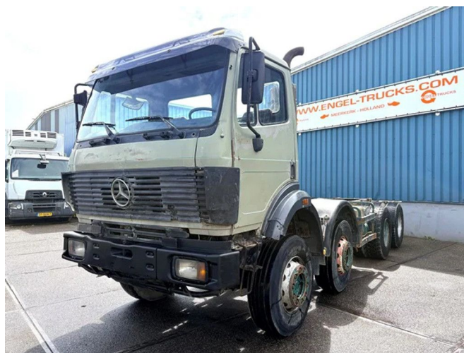
Mercedes-Benz SK 3234 B 8x4 FULL STEEL CHASSIS (V6 ... Referentienummer: SN 59995734