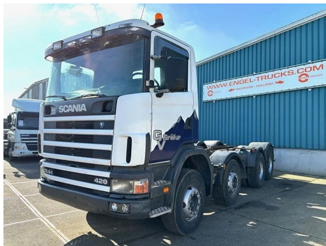
Scania R124-420 C 8x4 FULL STEEL CHASSIS (EURO 3 / F...