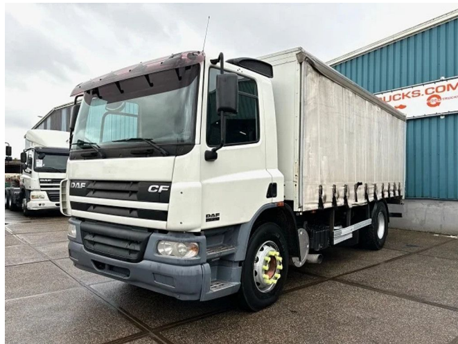
DAF 75 .310 4x2 WITH CURTAIN SIDE BOX (EURO 3 / MAN...