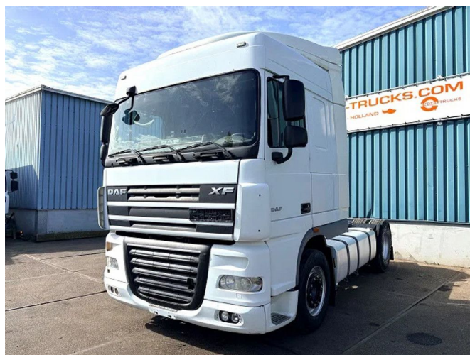
DAF XF 105.460 ATE SPACECAB 4x2 (EURO 5 / AS-TRONIC...