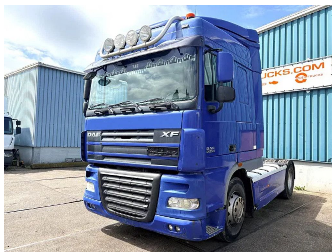
DAF XF 105.460 ATE SPACECAB 4x2 (EURO 5 / ZF12 MA...