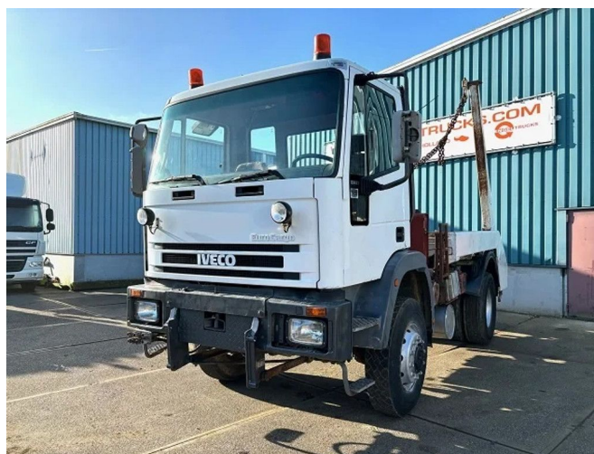
Iveco Eurocargo 135E23WR 4x4 FULL STEEL PORTAL CON...