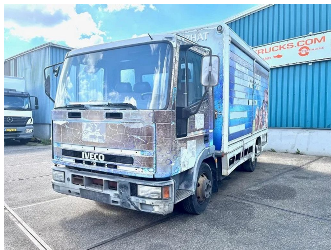
Iveco EuroCargo 75 E12 FULL STEEL CHASSIS WITH ... 4x2