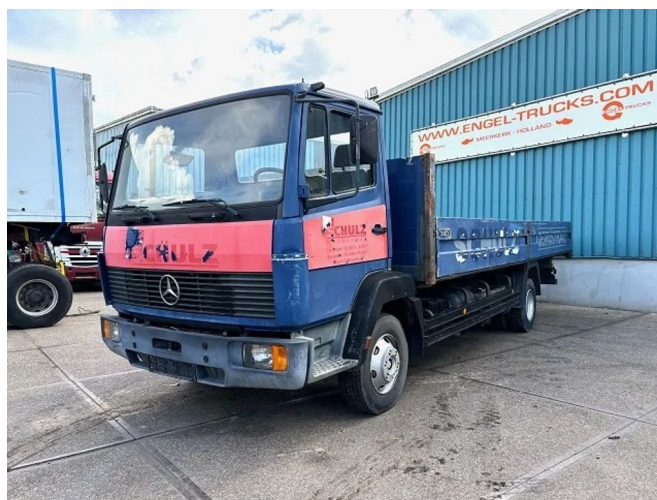
Mercedes-Benz LK 814 (6-CILINDER) FULL STEEL SU... 4x2 Referentienummer: SN 56411062