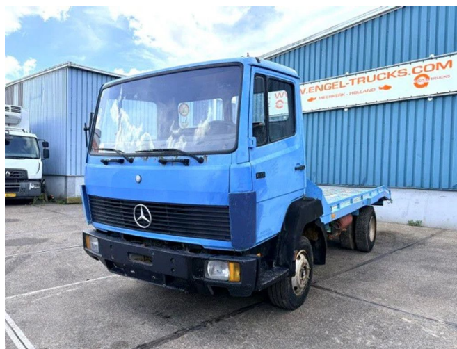
Mercedes-Benz LK 914 (6-CILINDER) RECOVERY TR... 4x2 Referentienummer: SN 60535158