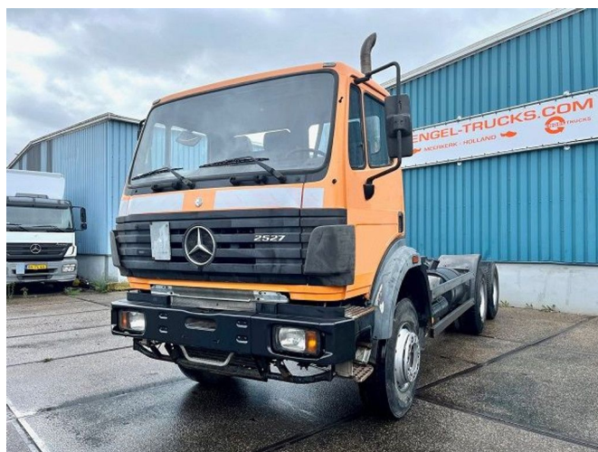
Mercedes-Benz SK 2527 K 6x4 FULL STEEL CHASSIS (MA...