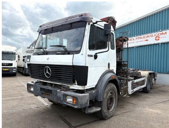
Mercedes-Benz SK 2527 6x2 HOOK-ARM SYSTEM WITH H...