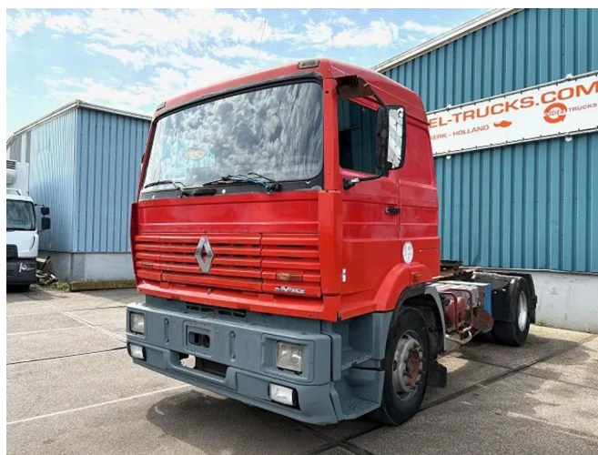
Renault G340 Manager 4x2 TRACTOR (MECHANICAL PUMP...