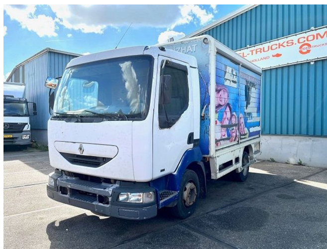
Renault Midlum 135.08 FULL STEEL WITH CLOSED D... 4x2