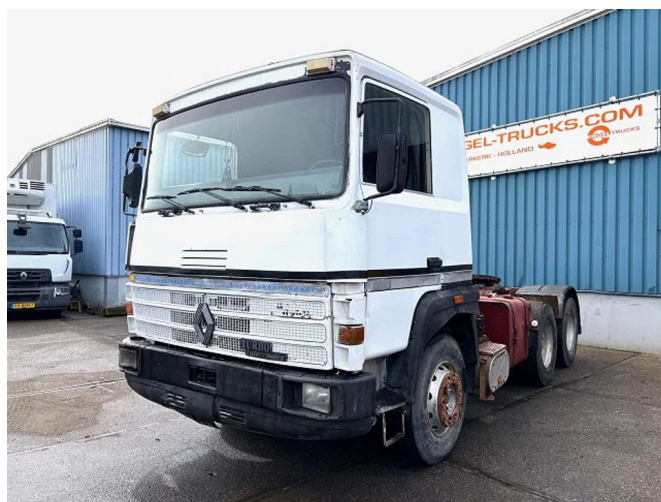
Renault R385 Major 6x4 SPRING SUSPENSION/LAMME (ZF... Referentienummer: SN 59970039 Z