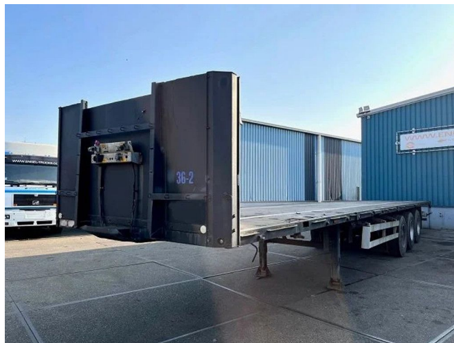
Van Hool 3B1047 13.60M. FLATBED TRAILER WITH 40FT ... Referentienummer: SN 51938877