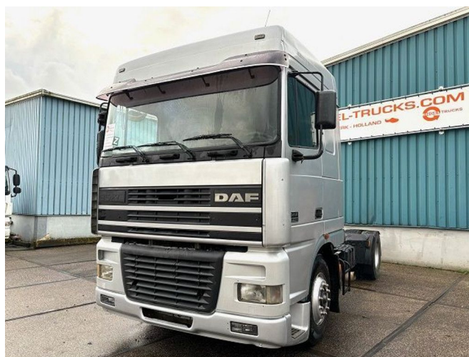
DAF 95.430 XF SPACECAB (EURO 2 / ZF16 MANUAL ... 4x2