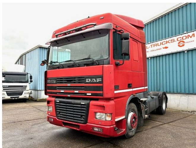
DAF 95.480 XF SPACECAB (EURO 3 / ZF16 MANUAL ... 4x2