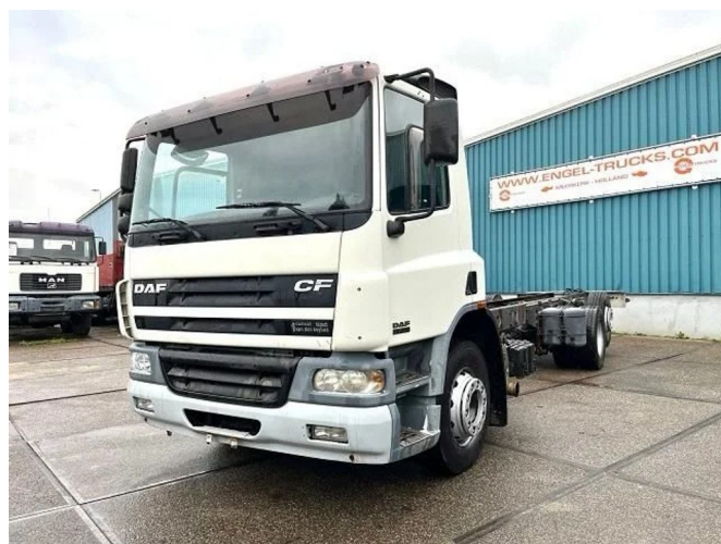
DAF CF 75.250 6x2 DAYCAB CHASSIS (EURO 3 / ZF MAN...