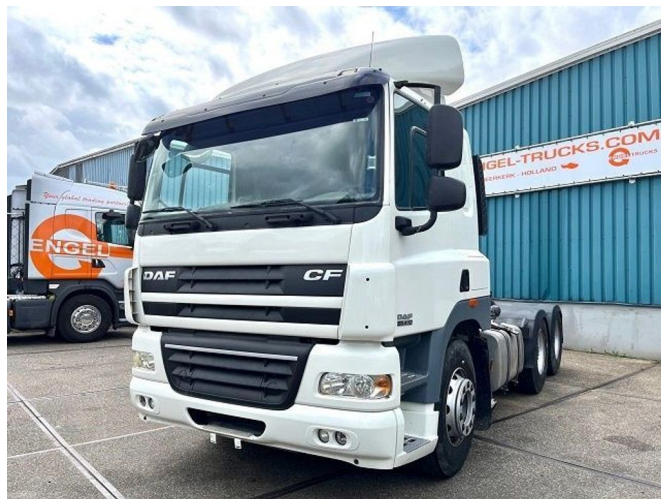
DAF CF 85.410 6x4 HEAVY DUTY TRACTOR UNIT (EURO 5 ... Referentienummer: SN 55355601 Z