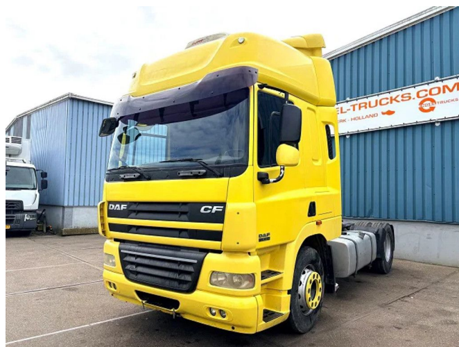
DAF CF 85.410 SPACECAB (ZF16 MANUAL GEARBOX... 4x2