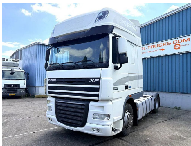
DAF XF 105.460 ATE SUPERSPACECAB (EURO 5 / Z... 4x2 Referentienummer: SN 60383030