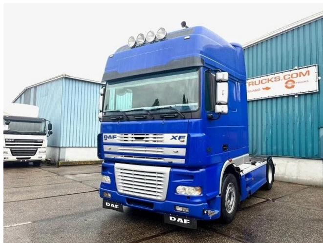
DAF XF 530 SUPERSPACECAB 4x2 TRACTOR UNIT (EURO...