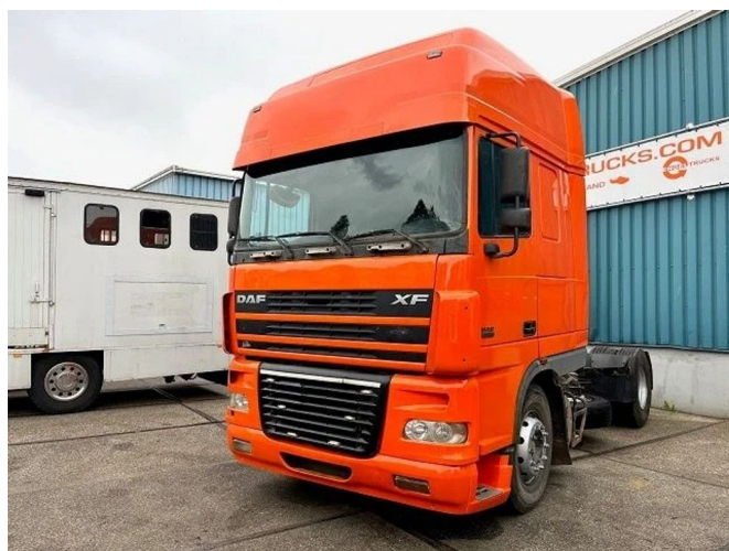
DAF XF 95-430 SUPERSPACECAB (EURO 3 / ZF16 M... 4x2