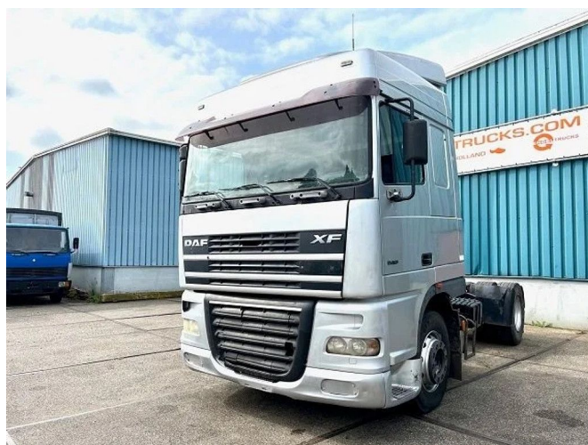
DAF XF 95.430 SPACECAB 4x2 TRACTOR UNIT (EURO 3 / ...