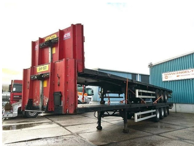
LAG O-3-39 13.60 METER 3-AXLE FLATBED (DRUM BRAK...