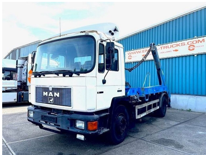
MAN 18 .232 (6 CILINDER) M90 WITH TELESCOPIC ... 4x2 Referentienummer: SN 55609062