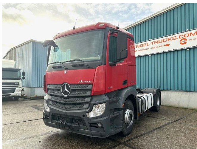
Mercedes-Benz Actros 1840 LS 4x2 SLEEPERCAB (6 IDENT... Referentienummer: SN 55955932