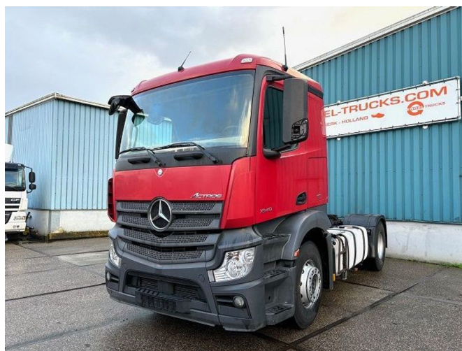
Mercedes-Benz Actros 1840 LS 4x2 SLEEPERCAB (6 IDENT... Referentienummer: SN 55945931