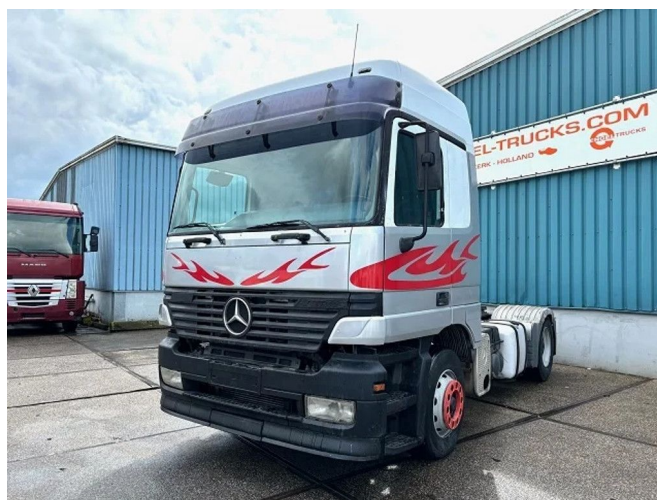
Mercedes-Benz Actros 1843 LS (MP1) (EPS WITH CLU... 4x2