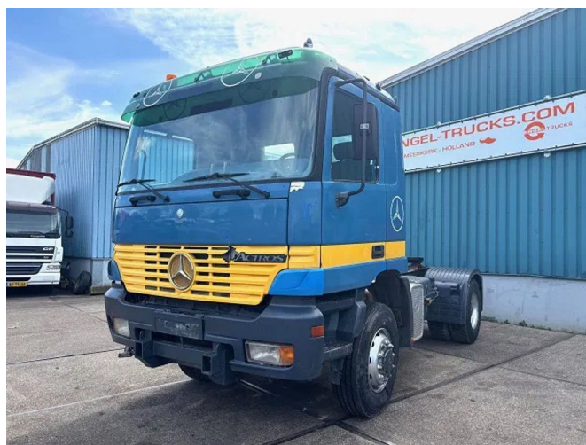
Mercedes-Benz Actros 2040 AS 4x4 FULL STEEL SUSPENS... Referentienummer: SN 57922171 Z