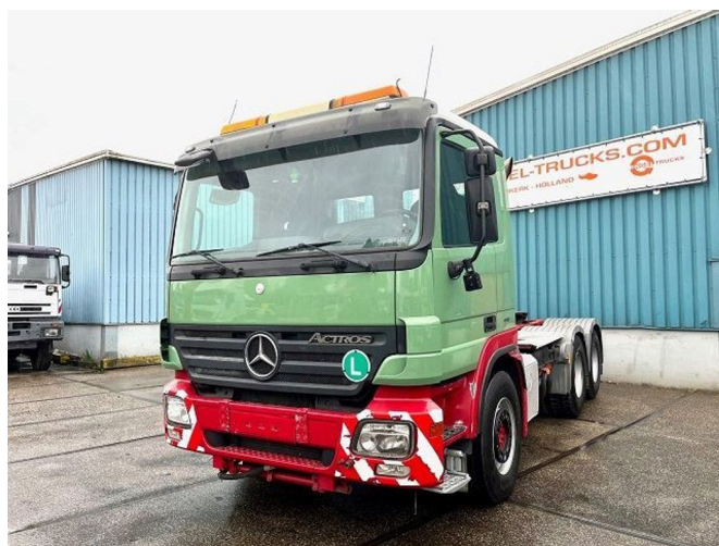
Mercedes-Benz Actros 2644 LS 6x4 (ORIGINAL 331.500 KM.)... Referentienummer: SN 54747680