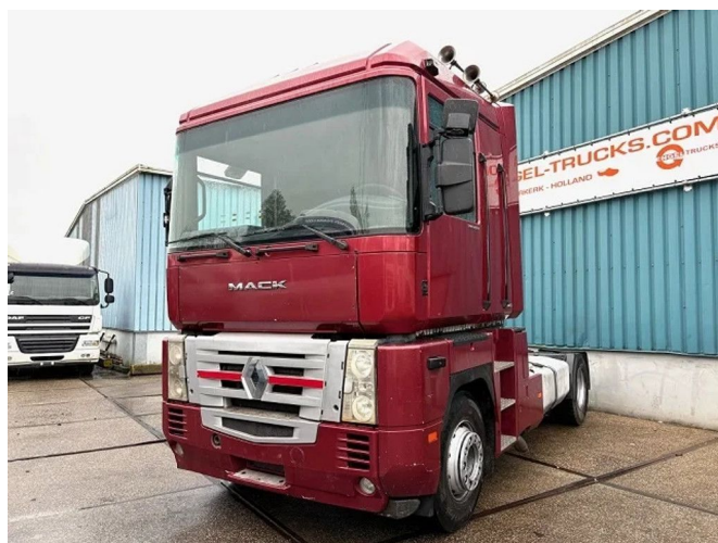
Renault Magnum 440 E-TECH (EURO 3 / ZF16 MANUA... 4x2